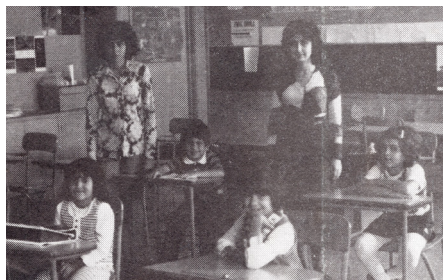
Armenian Kindergarten class, Saint Gregory's Armenian Church Saturday School, 1977

In its close to forty-five year history, KZV Armenian School has weathered the numerous educational trends,